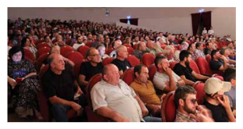
Meeting with fuelwood consumers in the Guria region

In total, the event was attended by up to 250 people from different parts of Guria (including