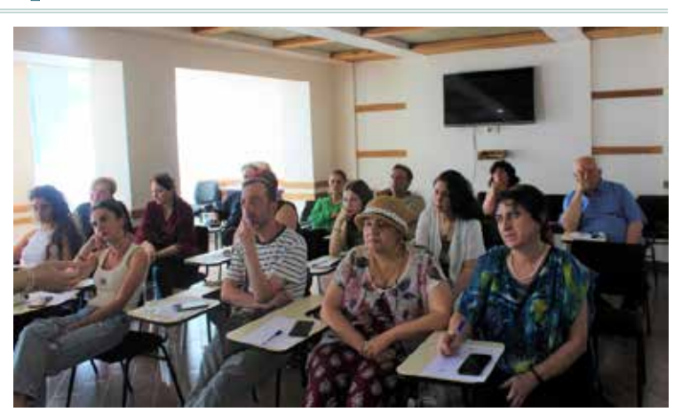
Media workshop in Guria

On the 19th of July, within the frames of ECO. Georgia project, a workshop was organized for the media representatives in the Guria region. The objective of the workshop was to strengthen media representatives in media approaches for covering environmental issues and informing the public.