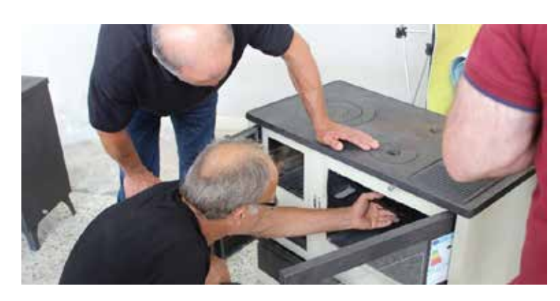
Observing the EE stoves together with producers

The representatives of the Rural Development Agency, GIZ, and Ecovision informed the audience about the ongoing processes in the Forest Sector Reform – respectively in the ECO. Georgia project, about the benefits and expected results that the project will create in the region through the envisaged activities in cooperation with local municipalities and the central and local representation of project Executive Entities.