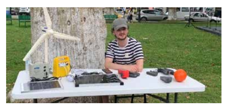
© Ecovision: Educational activities for kids in Ozurgeti