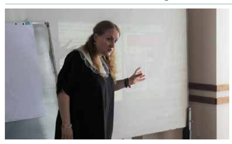
Media workshop in Guria

On the 19th of July, within the frames of ECO. Georgia project, a workshop was organized for the media representatives in the Guria region. The objective of the workshop was to strengthen media representatives in media approaches for covering environmental issues and informing the public.