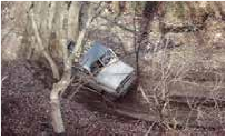
Example of photo captured by the photo-trap

Within the frames of the ECO.Georgia project, more equipment is procured to strengthen the Department of Environmental Supervision of the Ministry of Environmental Protection and Agriculture.