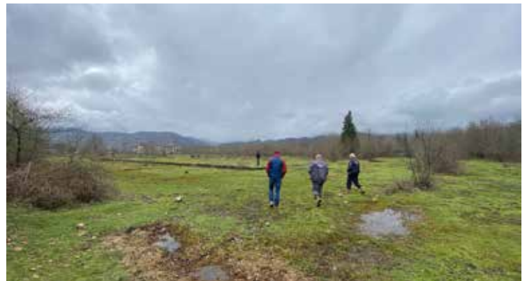
Area allocated for BSY in Kvenobani (Chokhatauri, Guria)

ECO.Georgia representatives, including the National Forestry Agency and GIZ, visited the three allocated areas for the Business Service Yards (BSY) in Guria - Supsa, Lanchkhuti and Kvenobani (Chokhatauri). The purpose of the visit was to conduct a Rapid Environmental Assessment following the GCF requirements of assessing soil, flora and fauna, red list species with IUCN criteria, risk/impact assessment and rapid social assessment. Two of the sites were found to comply with environmental criteria, while one site was found to be ecologically sensitive.