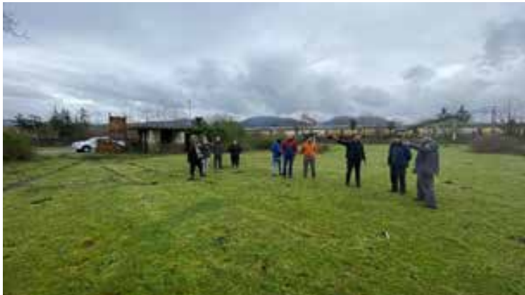
Area allocated for BSY in Supsa (Guria)

According to the NFA, before allocating the areas for the BSY, the local people were informed about the plans, to hear their opinions and to suggest alternative solutions if needed - for instance, the usage of BSY land as grazing area for cattle.