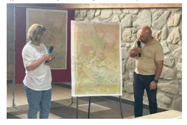
GIZ Workshop in Akhmeta: Mapping Ecosystem Services

Considering the findings of the consultancy and following the 4 phases of the FMP process, the respective team of ECO.Georgia/GIZ developed a concept of the Improved Public Participation Approach (IPPA) in the Georgian Forest Management Planning and Implementation Approach. The IPPA concept was discussed together with the Ministry of Environmental Pro-