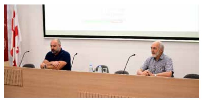
A public presentation on Urban Forestry

The event was attended by the representatives of the Ministry of Environmental Protection and Agriculture, National Forestry Agency, Tbilisi City Hall, NGOs and Initiative Groups active in urban forestry, as well as professors and students of Ilia State University.