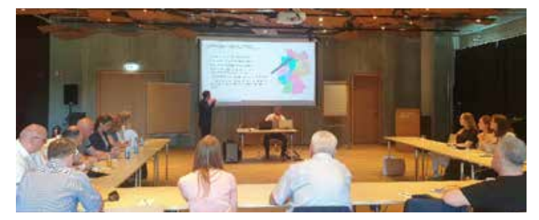
Study tour in Germany about energy-efficient procurement

The delegation of the study tour was composed of representatives of the public sector: the State Procurement Agency, the Ministry of Economy and Sustainable Development, the Ministry of Environ-