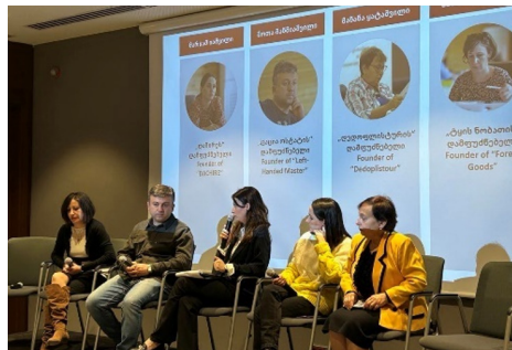
Panel discussion at the event

In conclusion, the collaborative efforts of Sparkasse Stiftung Georgia, GIZ, and the Swiss government have not only empowered small and medium-sized entrepreneurs but have also played a role in safeguarding the implementation of Georgia's forest sector reform – the overarching goal of the ECO.Georgia project. Each contribution can be likened to a brick, fortifying the foundation of positive change within the region.'