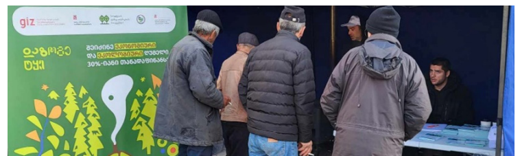
Demonstration space in Tianeti

The event took place during the town market hours and in total, up to 250 locals visited the demonstration space. The event served to raise awareness about the importance of saving forests, making environmentally conscious choices in daily lives, the benefits of energy-efficient solutions and their affordability.