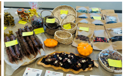
Expo of small entrepreneurs from the regions