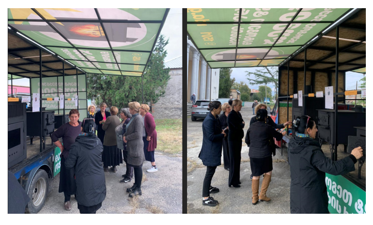
Demonstration bus visiting the target municipality

Within the framework of the ECO.Georgia project, the Environmental NGO Ecovision launched a demonstration initiative featuring an energy-efficient stove bus that toured the target municipalities of the ECO.Georgia project. This initiative provided an opportunity for local communities to observe new stove designs and learn about the advantages of energy-efficient models compared to common stoves, which are mostly used by households relying on firewood.