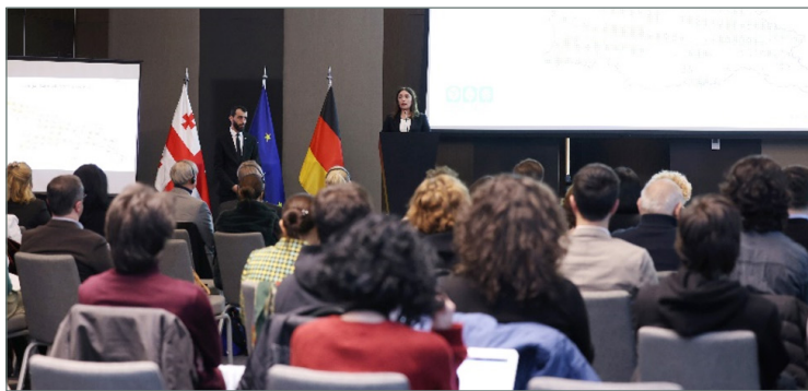
The Deputy Minister of Environmental Protection and Agriculture opening the event