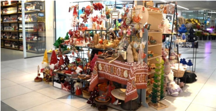
Christmas fair in city mall

Recently, product labeling for more than 50 items was completed, and a Christmas Fair took place from December 7th to January 9th in Tbilisi's central malls, such as City Mall, HomeMart and Ethnodesign store.