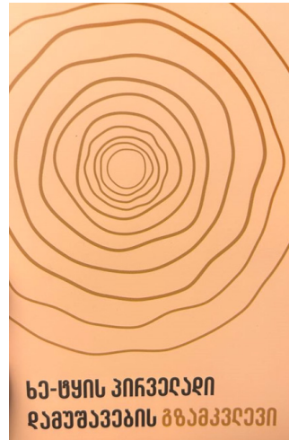
Guide for the primary wood processing

The closing event not only celebrated the project’s achievements but also offered an opportunity for future collaborations.