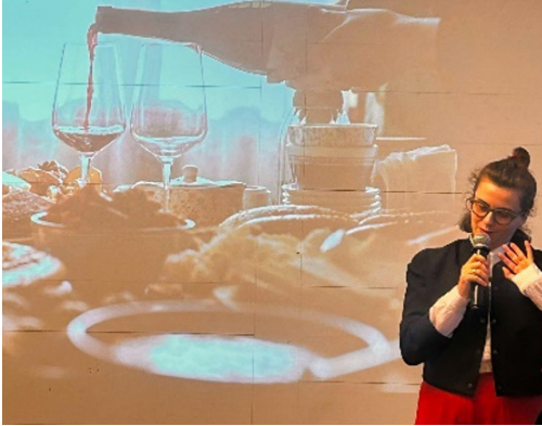
Story of the “Carpenter’s House”

A key highlight of the event was the sharing of success stories by grantees from the NTFP, TFP, and eco-tourism sectors. The beneficiaries described their efforts to promote and sustain their businesses.