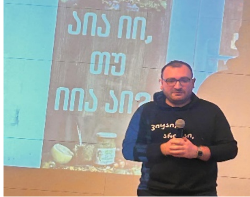
© giz: Story of the “Badishi”