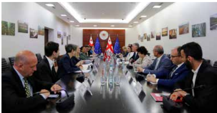
The Minister of Environmental Protection and Agriculture, Mr. Otar Shamugia met with the representatives of the business sector of the Swiss Confederation.