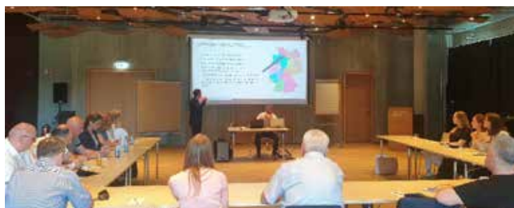
Study tour in Germany about energy-efficient procurement