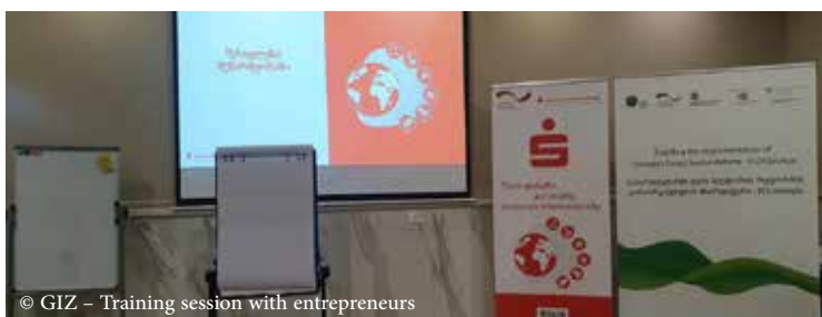
Training session with entrepreneurs

The third module will provide business coaching sessions for the selected 24 candidates to support them in the further development of their products or business plan.