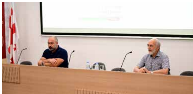
A public presentation on Urban Forestry

The event was attended by the representatives of the Ministry of Environmental Protection and Agriculture, National Forestry Agency, Tbilisi City Hall, NGOs and Initiative Groups active in urban forestry, as well as professors and students of Ilia State University.