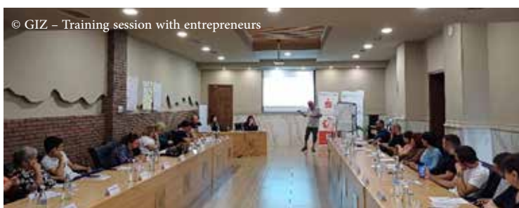
Training session with entrepreneurs

To enable the implementation of Georgia's Forest Sector Reform, one of the important components among others is to strengthen the municipalities and forest adjoining communities, providing diversified income sources and improved livelihood opportunities through the development of forest-related value chains, and increased entrepreneurial skills and knowledge of the local population.