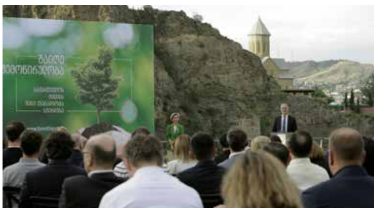
The presentation of the new platform was held in the botanical garden. The Minister of Environmental Protection and Agriculture, Mr. Otar Shamugia, representatives of the diplomatic corps accredited in Georgia, the business sector, and environmental non-governmental organizations attended the event.