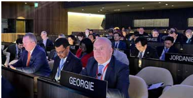
The Deputy Minister of Environmental Protection and Agriculture of Georgia, Mr. Solomon Pavliashvili, attended the Paris International Forum to End Plastic Pollution in Cities.

Within the framework of the Forum, Mr. Solomon Pavliashvili participated in two thematic discussions: sustainable production/use of plastic and prevention of plastic pollution.