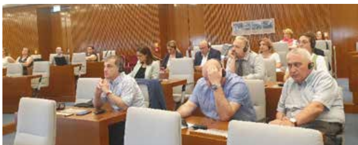
Study tour in Germany about energy-efficient procurement

The delegation of the study tour was composed of representatives of the public sector: the State Procurement Agency, the Ministry of Economy and Sustainable Development, the Ministry of Environ-