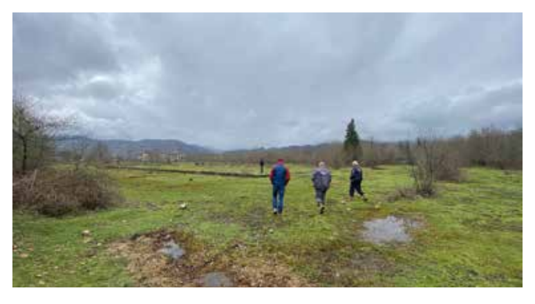
Area allocated for BSY in Kvenobani (Chokhatauri, Guria)

ECO.Georgia representatives, including the National Forestry Agency and GIZ, visited the three allocated areas for the Business Service Yards (BSY) in Guria - Supsa, Lanchkhuti and Kvenobani (Chokhatauri). The purpose of the visit was to conduct a Rapid Environmental Assessment following the GCF requirements of assessing soil, flora and fauna, red list species with IUCN criteria, risk/impact assessment and rapid social assessment. Two of the sites were found to comply with environmental criteria, while one site was found to be ecologically sensitive.