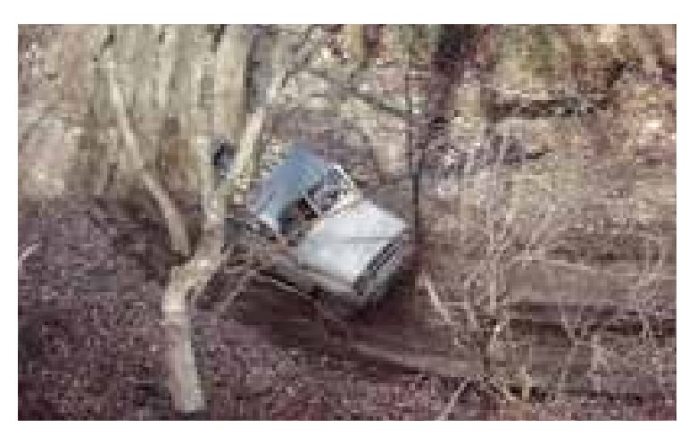
Example of photo captured by the photo-trap

Within the frames of the ECO.Georgia project, more equipment is procured to strengthen the Department of Environmental Supervision of the Ministry of Environmental Protection and Agriculture.