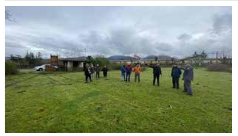
Area allocated for BSY in Supsa (Guria)

According to the NFA, before allocating the areas for the BSY, the local people were informed about the plans, to hear their opinions and to suggest alternative solutions if needed - for instance, the usage of BSY land as grazing area for cattle.