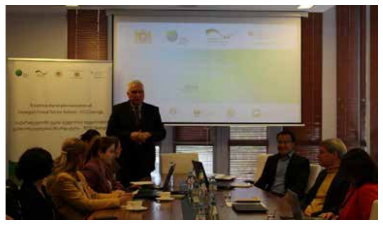
Workshop on energy-efficient procurement

Within the frames of the ECO.Georgia project, the German Energy Agency "dena" (https://www.dena.de/) got involved in sharing the best European practices of advanced European countries with the SPA and bringing knowledge in energy-efficient public procurement to the country.