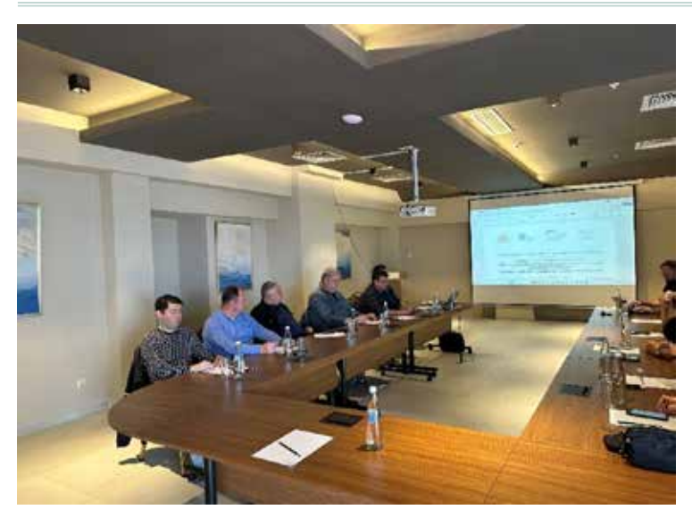
Workshop on the municipality toolkit concept development for the decision making in municipal forest management

The ECO.Georgia project conducted a workshop in the Guria region together with the target municipality representatives. The main objective of the workshop was to present and agree on the concept of the development of a toolbox for decision-making in the field of municipal forest management (MFM). The development of such a toolbox is important for the availability of a comprehensive set of analytical and implementation tools for making decisions on (1) whether to engage in MFM, (2) on the implementation structures of MFM, respective capacity development measures, and equipment procurement, and (3) on the implementation of specific MFM measures. Thus, the agreement on the toolbox concept based on discussion is very important for the joint implementation.