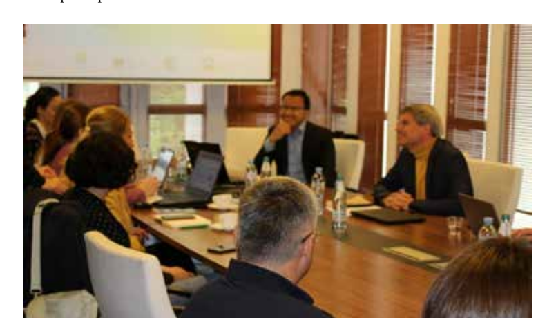
Workshop on energy-efficient procurement

As part of the cooperation between "dena" and the SPA, the parties will develop methodological guidelines and recommendations on energy-efficient public procurement for the organizations. At the beginning of May, the workshop took place at the State Procurement Agency where the participants from dena, SPA, the Ministry of Environmental Protection and Agriculture, the Ministry of Economy and Sustainable Development of Georgia and GIZ held a discussion to develop the methodological guideline and exchanged experience of energy-efficient public procurement.