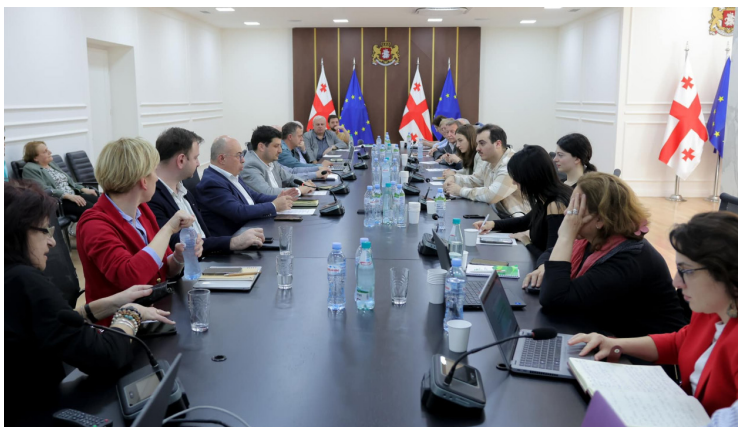
The Deputy Minister of Environmental Protection and Agriculture, Mr. Kakha Kakabadze, attended the meeting, where parties discussed the progress of the National Forestry Program.

The discussion included Georgia’s efforts to encourage the production and use of alternative fuels, legislative amendments, and the potential of ensuring an alternative solid fuel supply in the country.