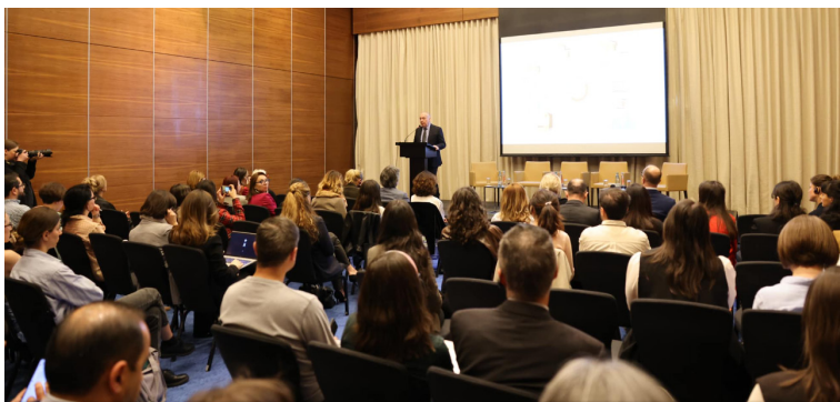
The Deputy Minister of Environmental Protection and Agriculture, Mr. Solomon Pavliashvili, attended the presentation of the new project: “Circular City Lab” in Georgia, which will be launched by the German Society for International Cooperation (GIZ).

The Deputy Minister thanked the GIZ representatives for their assistance, emphasizing the importance of the involvement of donor organizations in Georgia’s transition to a green economy.