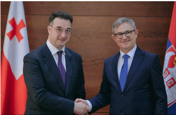
The Minister of Environmental Protection and Agriculture, Mr David Songulashvili, participated in an expanded-format meeting with the delegation of the President of the Republic of Serbia, held at the Administration of the Government of Georgia under the leadership of Prime Minister Irakli Kobakhidze.

The parties focused on deepening bilateral cooperation and expanding trade and economic relations between the two countries. Mr David Songulashvili noted that the official visit of the President of Serbia to Georgia is of historic significance and will contribute to a new stage in relations between the two countries.