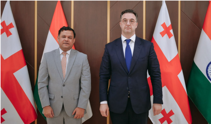
The Minister of Environmental Protection and Agriculture, Mr David Songulashvili, met with the newly appointed Ambassador Extraordinary and Plenipotentiary of the Republic of India to Georgia, Mr Amit Kumar Mishra.

Ambassador Mishra is the first resident Ambassador of the Republic of India to Georgia. According to Minister Songulashvili, the opening of the Embassy of the Republic of India in Georgia represents an important milestone and creates favourable conditions for deepening bilateral cooperation between the two countries.